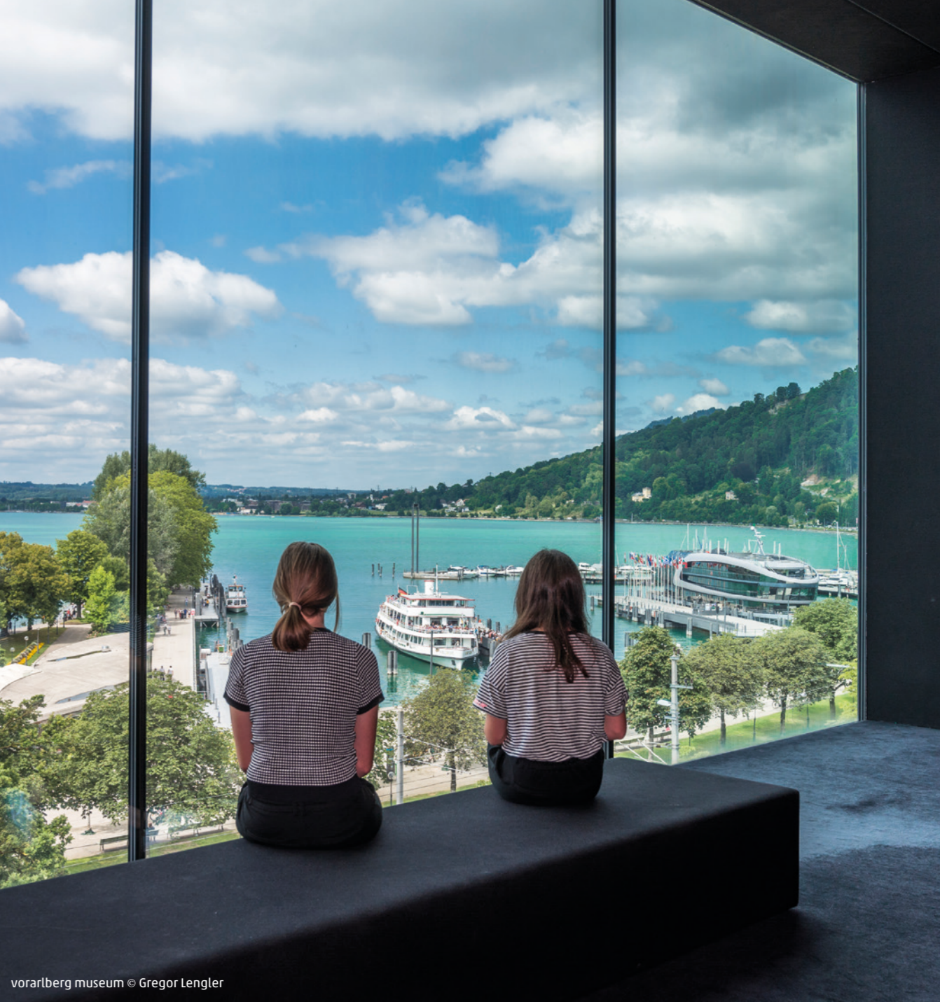
vorarlberg museum

For more information see www.vorarlberg.travel/culture