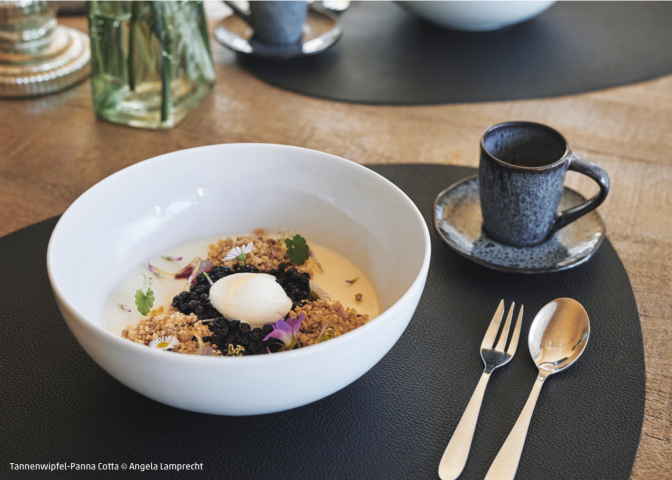
Tannenwipfel-Panna Cotta