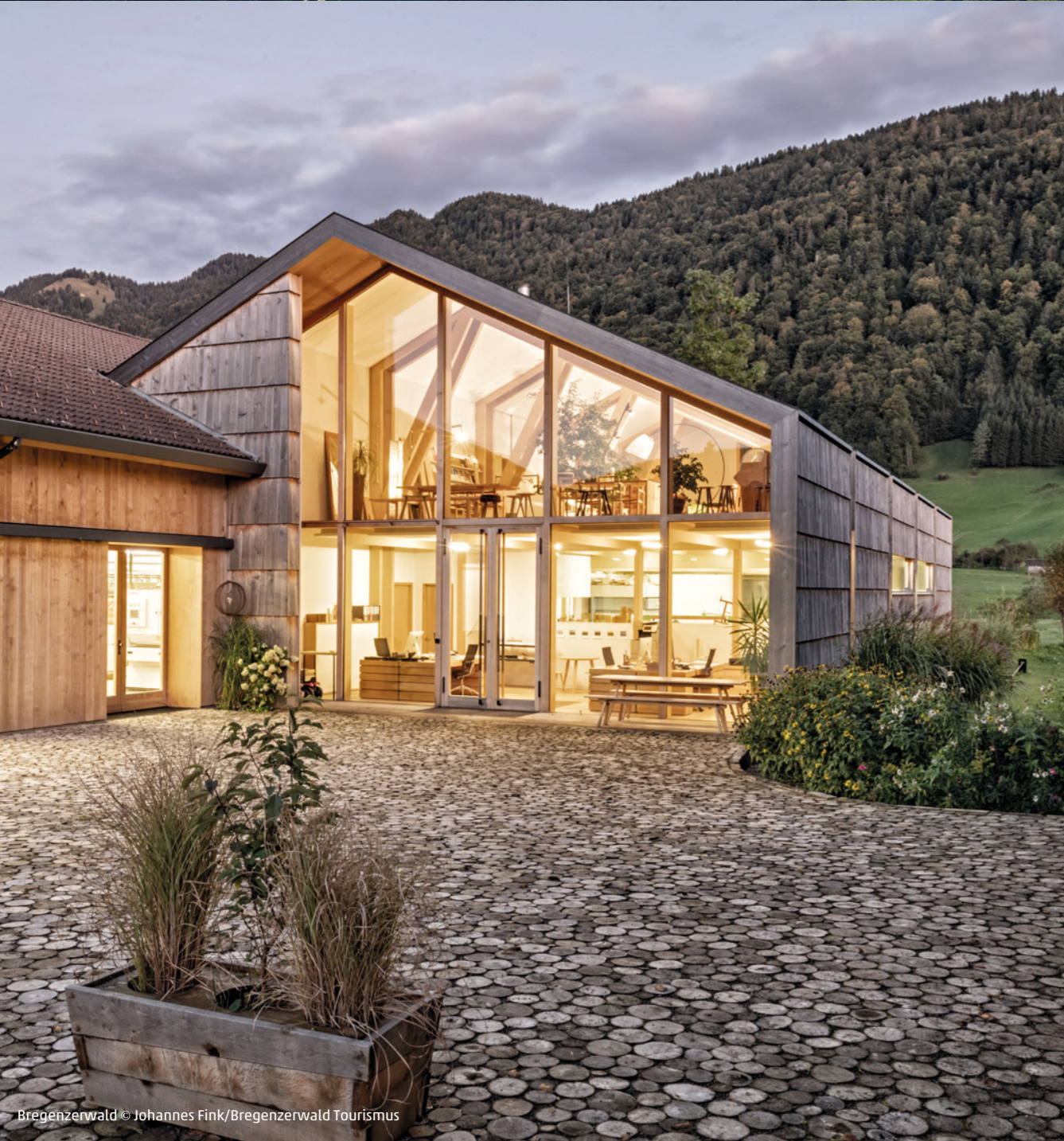
Bregenzerwald