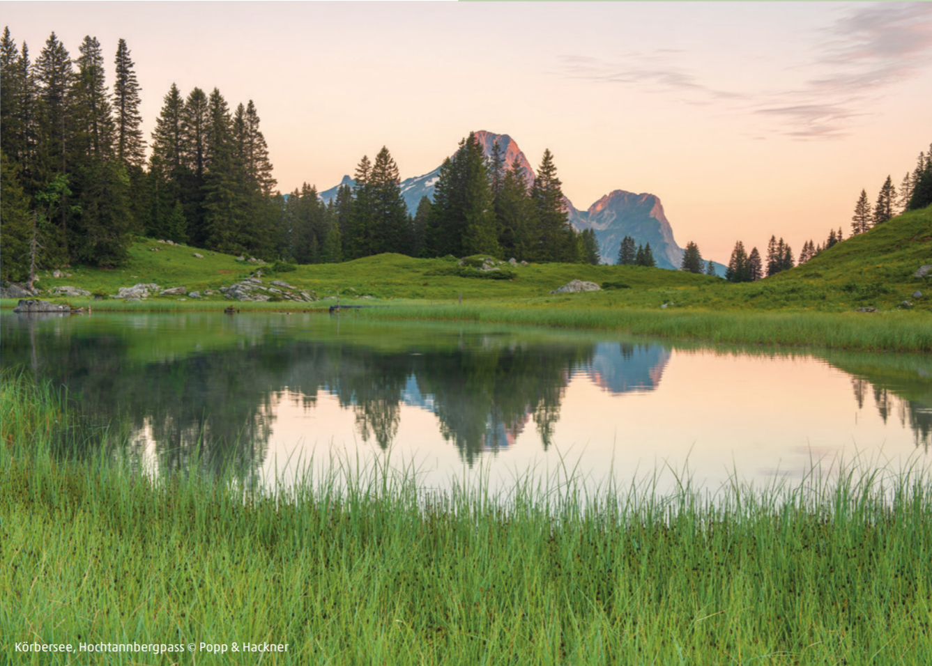
Körbersee, Hochtannbergpass