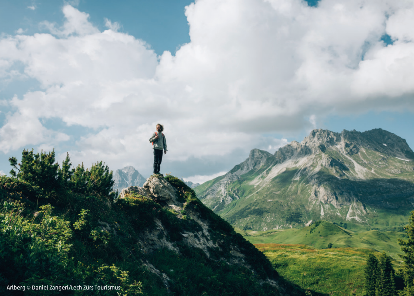
Arlberg